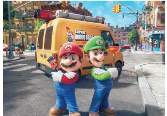
"SUPER MARIO BROTHERS"