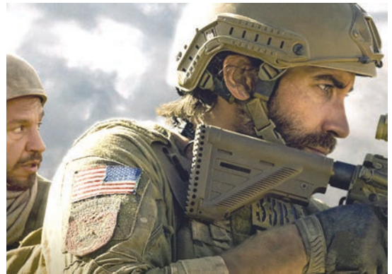
"GUY RITCHIE'S THE COVENANT"

With "Operation Fortune" a couple of months ago, "Guy Ritchie" has turned in two of the most enjoyable movies of the year to date. This one follows an American soldier in Afghanistan who is injured and flown home to recuperate. When he finds that his former Afghan translator is in hiding and being hunted, he takes it upon himself to go back and save him. Jake Gyllenhaal brilliantly plays this soldier, and the movie is really emotional and entertaining. It is a really strong story about two men thrown together by fate. Grade: A-