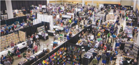
Des Moines Con.