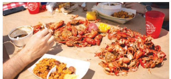
Cajun Fest.

Cajun delights make their way into downtown Des Moines with a spicy food contest, mask making, costume contest, live music and all the Cajun food your heart desires. www.cajunfestiowa.com/cajun-fest-2023 ■