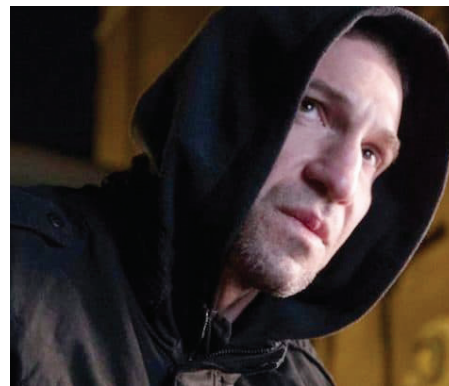
"We Own This City"