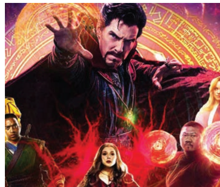
"Doctor Strange in the Multiverse of Madness"