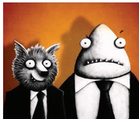
"The Bad Guys"