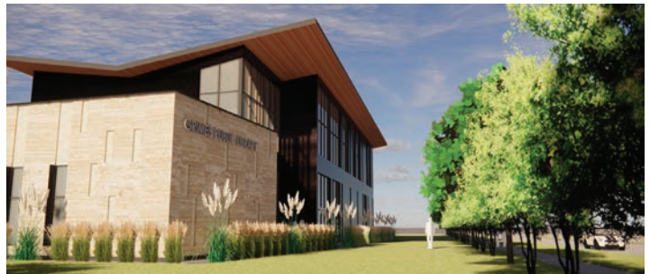
An artist's rendering shows what the new library will look like.

The public is invited June 28 to the 9 a.m. groundbreaking ceremony for the new Grimes Public Library at the corner of N.E. Beaverbrooke and N. James Street. The new 22,300-square-foot building will be just blocks north of its current location in the new Heritage development and will expand residents' access to items for community education and enrichment; open spaces to read or study; small study rooms; public use computers; drive-thru drop-off/pick-up window; programming space to accommodate both community and library programs; STEAM room optimized for hands-on learning, exploring and creating; baby and young child play spaces; and a teen mezzanine and gaming area. Construction will continue through fall 2023. ■