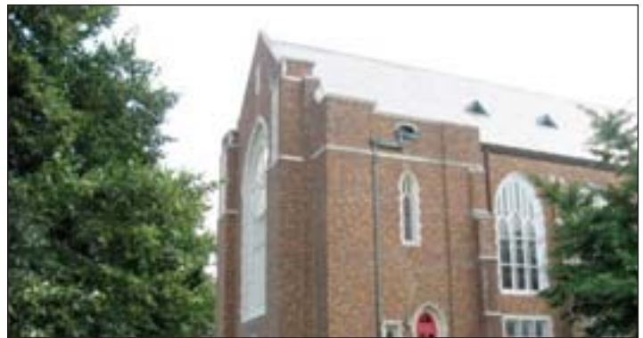
Westminster Presbyterian Church, 4114 Allison Ave., kicks off its Fine Art Series.